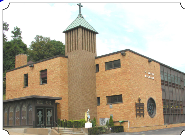
St. Michael Church 740 Wall Avenue • Pitcairn, Pennsylvania • 15140 412-373-2610