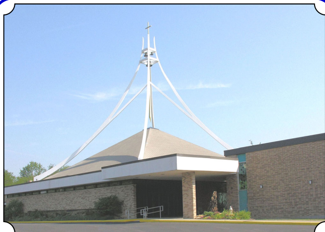
North American Martyrs Church 2526 Haymaker Road • Monroeville, PA • 15146 412-373-0330

Two Churches ~ One Community ~ A Pennsylvania Charitable Trust