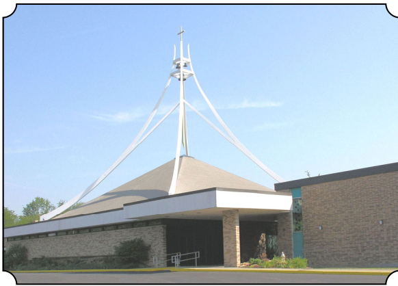
North American Martyrs Church 2526 Haymaker Rd • Monroeville, PA • 15146 412-373-0330

North American Martyrs is a vibrant parish, built on multi-generational and cultural traditions blended through the grace of the Holy Spirit. Reflecting the unconditional mercy of Jesus Christ, we as a faith community sharing God's love with all people, enthusiastically reach out to embrace everyone, especially the poor, broken, suffering and lost. We draw our strength through prayer, listening to and acting upon God's Word and celebrating the Eucharist, to foster a closer relationship with Christ as humble and faithful members of His Universal Church.