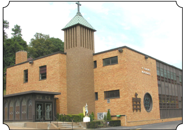
St. Michael Church 740 Wall Ave • Pitcairn, PA • 15140 412-373-2610