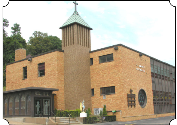
St. Michael Church 740 Wall Ave • Pitcairn, PA • 15140 412-373-2610