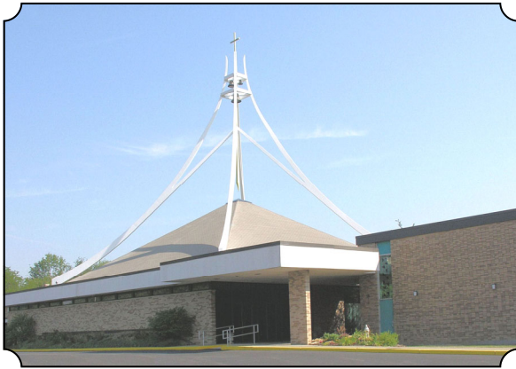
North American Martyrs Church 2526 Haymaker Rd • Monroeville, PA • 15146 412-373-0330

North American Martyrs is a vibrant parish, built on multi-generational and cultural traditions blended through the grace of the Holy Spirit. Reflecting the unconditional mercy of Jesus Christ, we as a faith community sharing God's love with all people, enthusiastically reach out to embrace everyone, especially the poor, broken, suffering and lost. We draw our strength through prayer, listening to and acting upon God's Word and celebrating the Eucharist, to foster a closer relationship with Christ as humble and faithful members of His Universal Church.