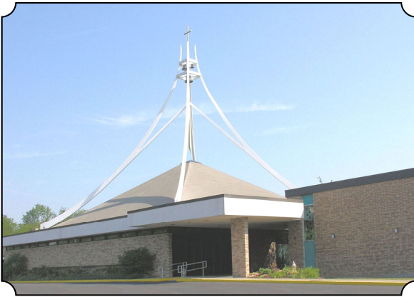
North American Martyrs Church 2526 Haymaker Rd • Monroeville, PA • 15146 412-373-0330

North American Martyrs is a vibrant parish, built on multi-generational and cultural traditions blended through the grace of the Holy Spirit. Reflecting the unconditional mercy of Jesus Christ, we as a faith community sharing God's love with all people, enthusiastically reach out to embrace everyone, especially the poor, broken, suffering and lost. We draw our strength through prayer, listening to and acting upon God's Word and celebrating the Eucharist, to foster a closer relationship with Christ as humble and faithful members of His Universal Church.