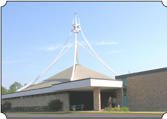
North American Martyrs Church 2526 Haymaker Rd • Monroeville, PA • 15146 412-373-0330

North American Martyrs is a vibrant parish, built on multi-generational and cultural traditions blended through the grace of the Holy Spirit. Reflecting the unconditional mercy of Jesus Christ, we as a faith community sharing God's love with all people, enthusiastically reach out to embrace everyone, especially the poor, broken, suffering and lost. We draw our strength through prayer, listening to and acting upon God's Word and celebrating the Eucharist, to foster a closer relationship with Christ as humble and faithful members of His Universal Church.