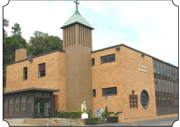
St. Michael Church 740 Wall Ave • Pitcairn, PA • 15140 412-373-2610